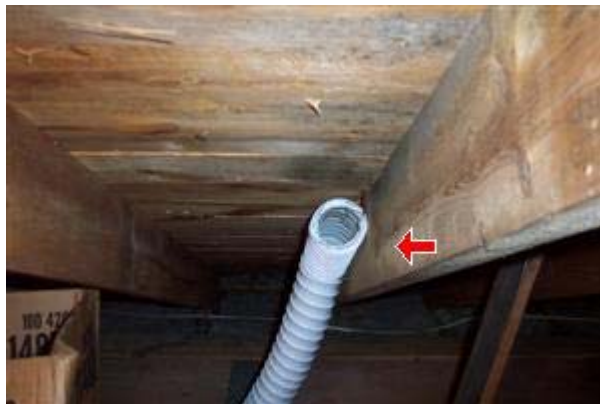
9.4 Picture 1

The Exhaust fan does not vent to outside at the guest bath. Vent pipes should terminate outside and not in the attic. Many homes have their vent pipe poised at the roof vent such as yours. It is up to you to determine whether or not this is a concern or needs further consideration from a general contractor. A qualified contractor should inspect and repair as needed.