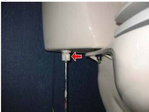
6.1 Picture 5

The water supply line for toilet is leaking at the guest bath. Repairs are needed. A qualified licensed plumber should repair or correct as needed.