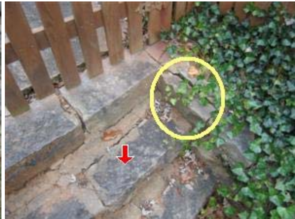
2.4 Picture 3

The slate floor on the patio at the front of home has deteriorated mortar or grout, and is loose and uneven in areas. A general replacement is likely. A qualified contractor should inspect and repair as needed.