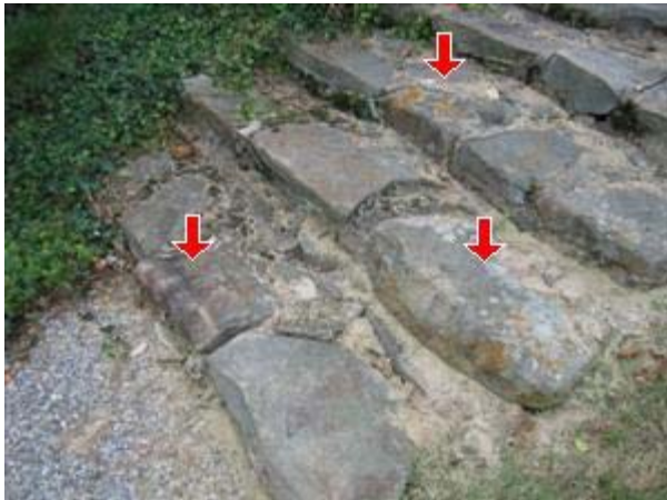
2.4 Picture 2

The rock steps at the front of home and rear of home are loose in areas. Water can cause further deterioration if not repaired and sealed properly. A qualified contractor should inspect and repair as needed.