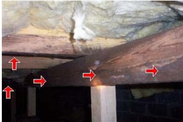
5.3 Picture 1

Signs of fungi growth is present on the floor system in crawlspace in several areas. We did not inspect, test or determine if this growth is or is not a health hazard. The underlying cause is moisture. I recommend you contact a mold inspector or expert for investigation or correction if needed.