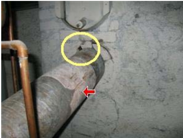
8.5 Picture 1

The vent pipe for oil fired boiler needs mastic sealed around pipe where it enters chimney. There is also a possibility of asbestos on the vent pipe. This is a safety issue and should be repaired. I recommend a qualified licensed heat contractor inspect further and repair as needed.