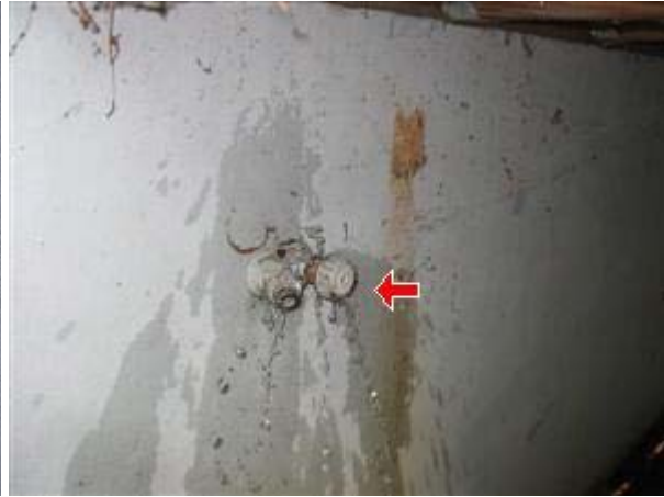
6.1 Picture 2

Polybutylene plastic plumbing supply lines (PB) are installed in the subject house. Polybutylene has been used in this area for many years, but has had a higher than normal failure rate, and is no longer being widely used. Copper and Brass fittings used in later years have apparently reduced the failure rate. This subject house has copper fittings. For further details contact the Consumer Plumbing Recovery center at 1-800-392-7591 or the web at http://www.pbpipe.com