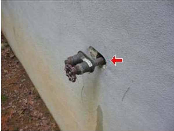
6.1 Picture 1