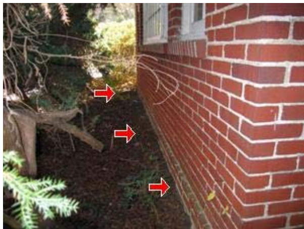
2.0 Picture 1

The Brick siding at the left side (facing front) is loose, and missing mortar. Further deterioration can occur if not corrected. A qualified contractor should inspect and repair as needed.