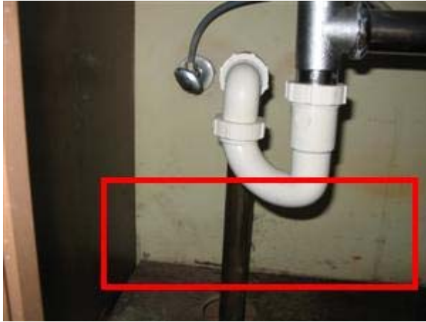
4.1 Picture 1

Signs of fungi growth is present on the interior wall of kitchen cabinetry in several areas. We did not inspect, test or determine if this growth is or is not a health hazard. The underlying cause is moisture. I recommend you contact a mold inspector or expert for investigation or correction if needed.