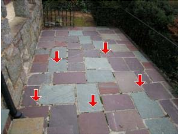
2.4 Picture 4