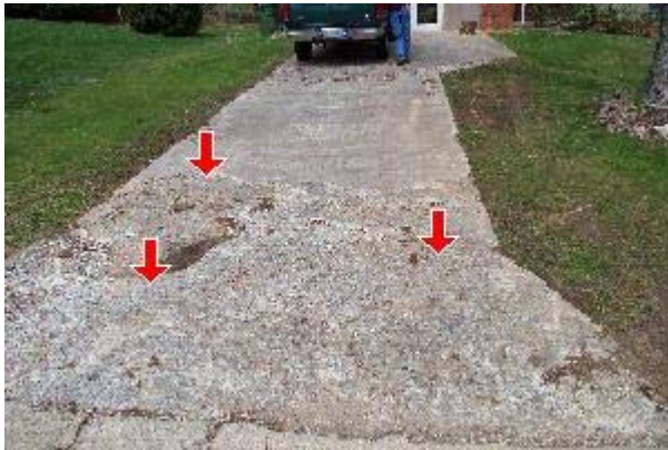
2.4 Picture 1

The concrete drive at the front of home are deteriorated in areas. A general replacement is likely. A qualified contractor should inspect and repair as needed.