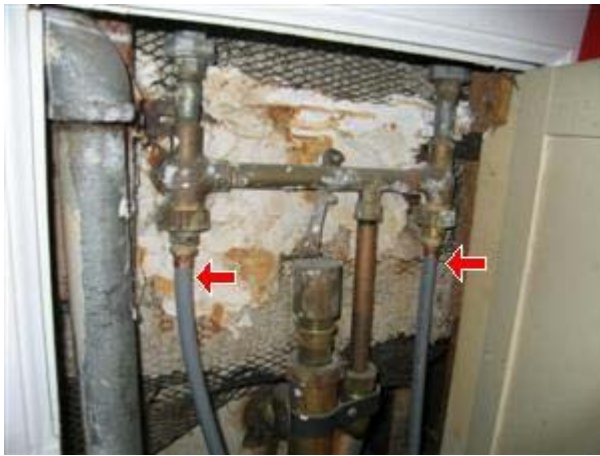
6.1 Picture 3

Polybutylene plastic plumbing supply lines (PB) are installed in the subject house. Polybutylene has been used in this area for many years, but has had a higher than normal failure rate, and is no longer being widely used. Copper and Brass fittings used in later years have apparently reduced the failure rate. This subject house has copper fittings. For further details contact the Consumer Plumbing Recovery center at 1-800-392-7591 or the web at http://www.pbpipe.com