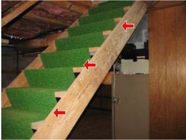
4.3 Picture 1