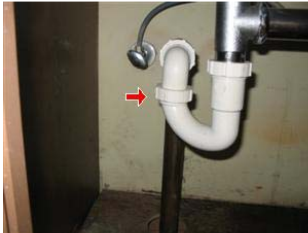
6.0 Picture 1

The waste line has a S-trap, and should be changed to a P-trap and "Auto-vent" at the Kitchen sink. This is not considered up to today's standard. A qualified licensed plumber should repair or correct as needed.