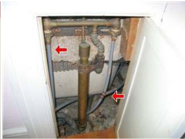
6.1 Picture 4

The water supply line for toilet is leaking at the guest bath. Repairs are needed. A qualified licensed plumber should repair or correct as needed.