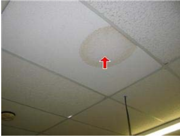
4.0 Picture 1