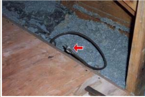
7.3 Picture 2