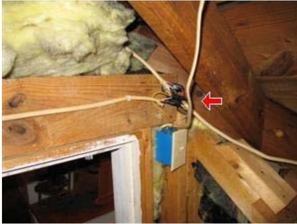
7.3 Picture 1