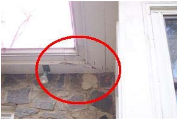
2.5 Picture 1

The soffit panel at eave on the front of home are weathered and beginning to deteriorate and peeling paint. Further deterioration may occur if not repaired. A qualified contractor should inspect and repair as needed.