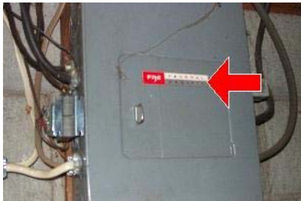
7.2 Picture 1

You have a Federal Pacific panel which is legal, but there is a possibility that the circuit breakers may not trip when shorted possibly causing an electrical hazard. Opinions by licensed electricians on this panel varies between safe and unsafe. I recommend you consult a licensed electrician for an opinion and correct if necessary.